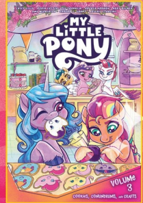
VOL. 3: COOKIES, CONUNDRUMS, AND CRAFTS

Join SUNNY STARSCOUT , IZZY MOONBOW , ZIPP STORM , PIPP PETALS , and HITCH TRAILBLAZER as they explore the brand-new Equestria!