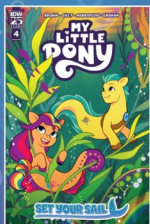
Cover A Art by Paulina Ganucheau