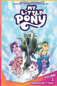
VOL. 2: SMOOTHIE-ING IT OVER