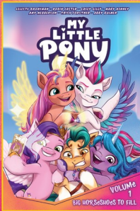
VOL. 1: BIG HORSESHOES TO FILL