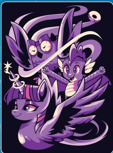
Art by Poxxy Boxy

We hope that our stories continue to connect with you and inspire you to create such amazing art!