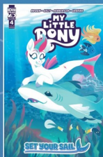
Cover B Art by JustaSuta